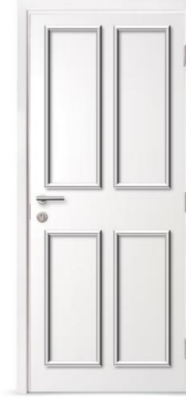
Plant On Panelled