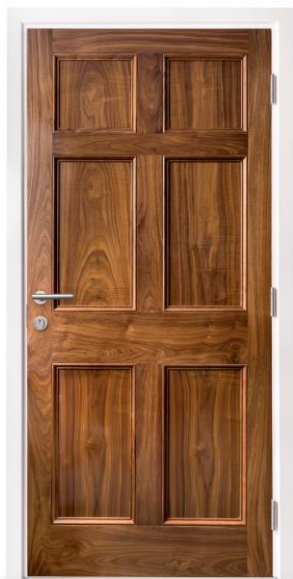
Panelled & Heritage