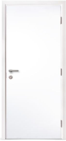
Premium Factory Painted

Ideal Applications: Residential - Heritage - Commercial